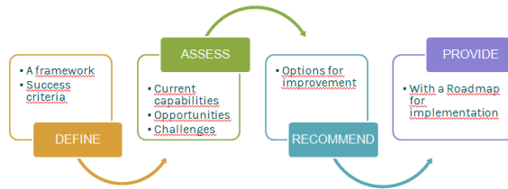
Fig. 1: MedSurplus Project structure

mately drive efficiency across the whole network.