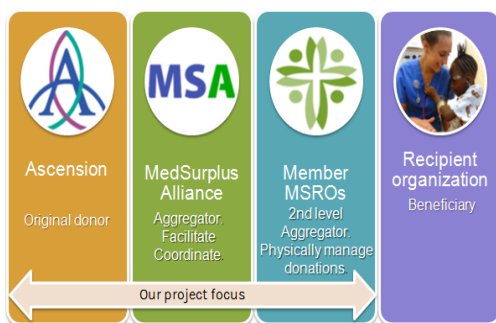
Fig. 2: Ascension—MSA stakeholders

This MSA proposes to support efficient, economical recovery and distribution of medical supplies from selected Ascension facilities by the MSA accredited MSROs. This project analyzes the MSA's current capabilities and provides a framework, recommendations, and roadmap to develop and implement a series of standard operating procedures and evaluations that will ultimately